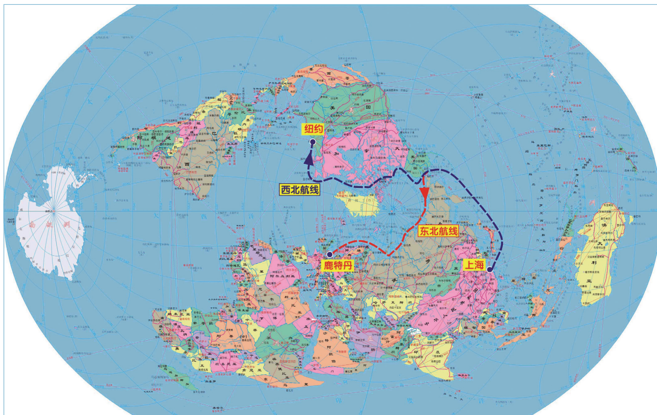
Figure 2. A Chinese view of Arctic sea routes

The captions label Shanghai, Rotterdam, New York, the 'North East Sea Route' (red) and the 'North West Sea Route' (blue).