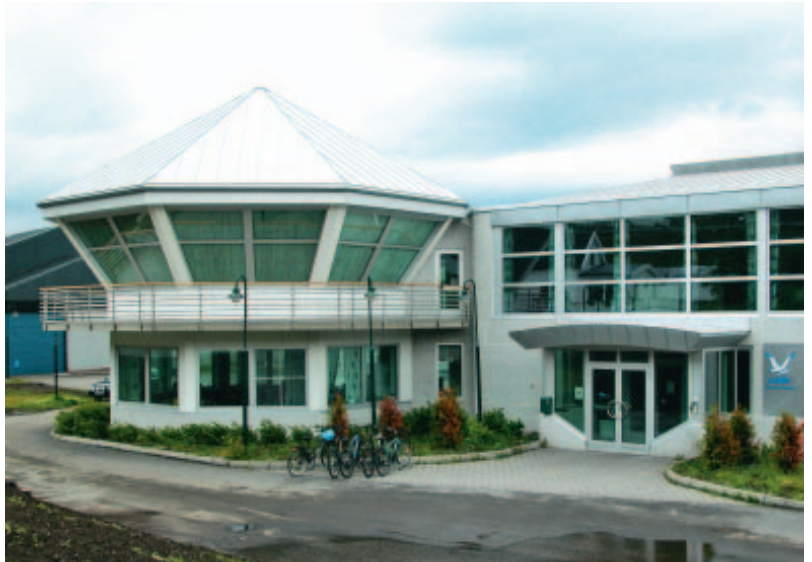
Facade of Lerøy Aurora's building